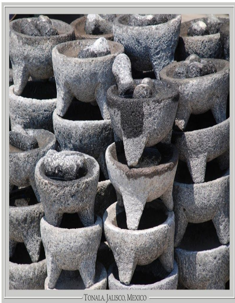
TONALA, JALISCO, MEXICO